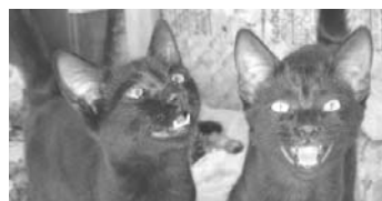
Beijing & HongKong